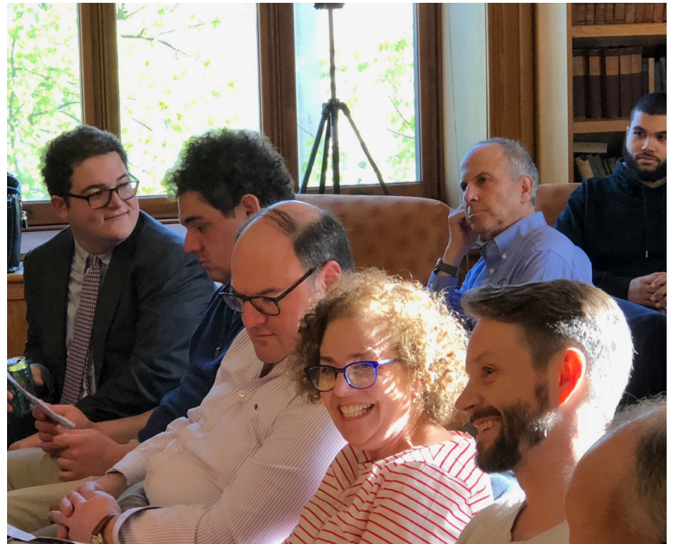
Friends and family gather for the annual Senior Symposium.