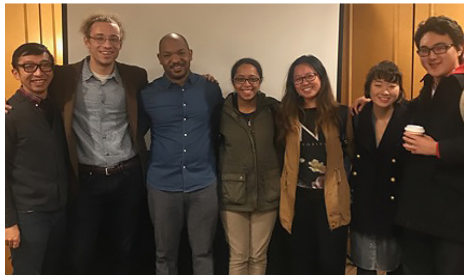
Northwestern Students at "We Demand: A Special Session for Undergraduates"