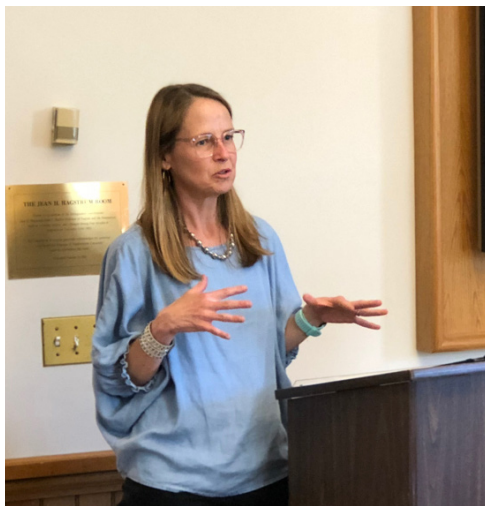
Introducing Senior Symposium presenters