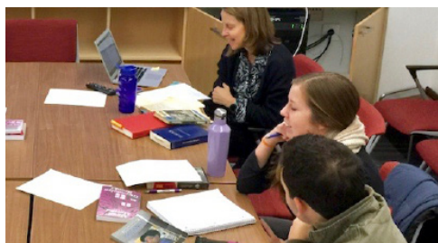
Leading the 301 Seminar